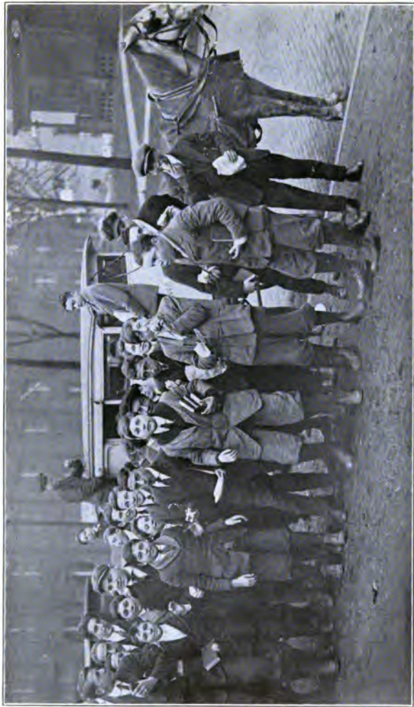
The school lunchrooms must compete with the bakers' wagons throughout the city